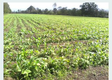
Above—April flooding we thought the crop was LOST!